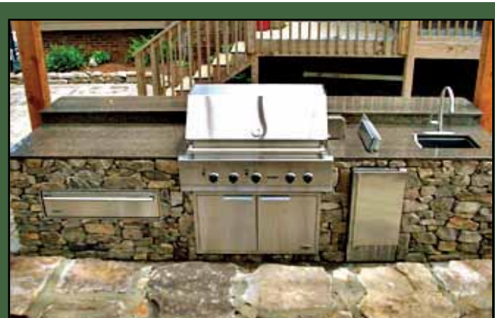
Fireplaces * Outdoor Kitchens * Patios