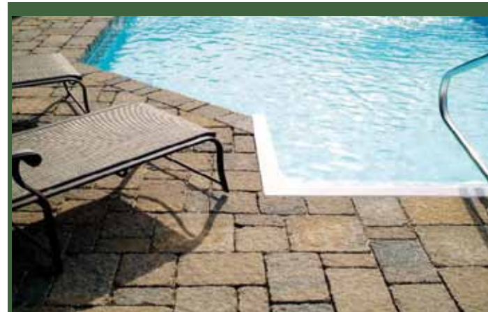
Outdoor Living * Pool Decks * Retainer Walls